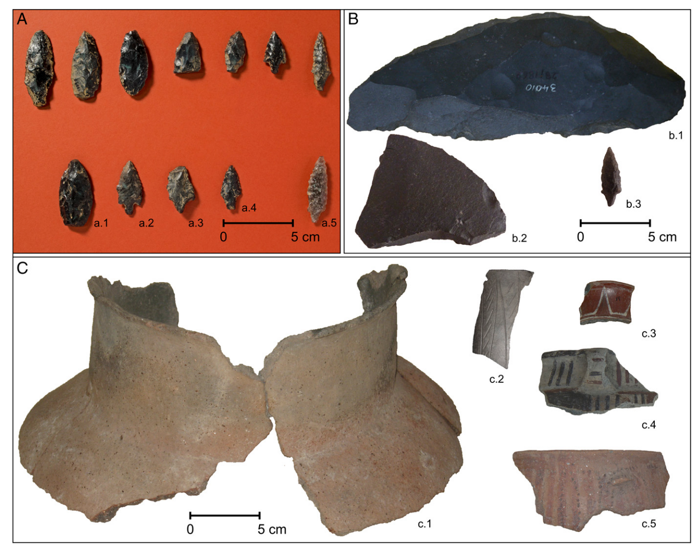
Fig. 2. ( A ) Obsidian artifacts from Cajón: Cavi source (top row and A .1); Purulla source ( A .2– A .4), and Ona source ( A .5); photograph courtesy of Sean Goddard. ( B ) Volcanic rock artifacts: from Hualfín ( B .1) [no. 34010, artifact owned by Museo Etnográfico, University of Buenos Aires], Cajón ( B .2) and Aconquija ( B .3). ( C ) Ceramics: ordinary ( C .1), polished gray incised ( C .2), Condorhuasi ( C .3) [UDM 6/R3, artifact owned by Museo de Antropología, University of Córdoba], Vaquerías ( C .4), and Ciénaga Red on Buff ( C .5) [no. 32180, artifact owned by Museo Etnográfico, University of Buenos Aires].

goods to sites in the network that lacked access to them. This pattern might be expressed as disproportionate densities of particular artifacts at sites according to rank, and with centralized production of lithic and pottery artifacts. Contrary to the centralized model, a decentralized model would expect the circulation of raw materials and finished goods in a variety of directions. This would result in the existence of multiple production areas for a variety of decorated pottery styles. In the cases of goods such as obsidian, which even in generally open regional exchange systems may be subjected to some level of selective or limited access (74), a decentralized model would imply a relatively even distribution of materials and a generally domestic production of artifacts across settlements of different standing in the network, given the absence of mechanisms and facilities for the organized control of production or distribution. The decentralized model would also be compatible with smaller, material-specific networks crisscrossing the larger circuits followed by other materials. These contrastive models encompass Nielsen's (75) classification of caravan network patterns: convergent or divergent (according to the degree of concentration in the flow of goods), and segmentary vs. continuous (according to the number of interconnected nodes), as well as Tripcevitch's