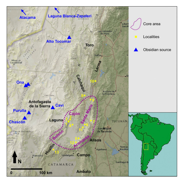
Fig. 1. Study area, with valleys, obsidian sources, and localities mentioned in the text. Clay sources: 1 and 2, Cardonal; 3, Yutopián; 4, Arcillas Verdes; 5, La Aspereza; 6, Quebrada de Jujuil; 7, Los Colorados; 8, Palo Pintado: 9, Las Conchas; 10, La Viña. Archeological sites: 11, Soria 2; 12, Ingenio del Arenal-Falda; 13, La Ciénaga. Full list of sites included in the study available in SI Appendix , Tables S1–S3.

Within the broader context of Andean exchange and ecological complementarity studies (46, 47), south-central Andean scholars